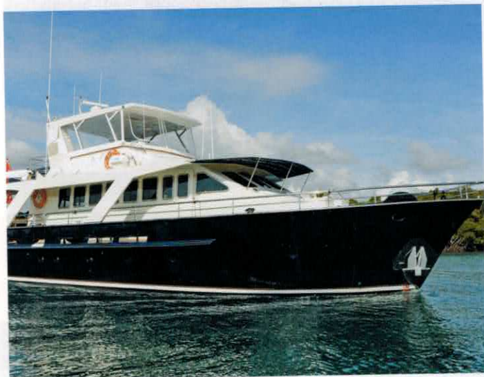
Left, clockwise from top: Blue Martini, Far North's newly refitted main vessel; the array of boats in Port Douglas harbour; Lizard Island, a prime fishing spot; a central console speeds away from the mother ship; right: aerial view of Port Douglas